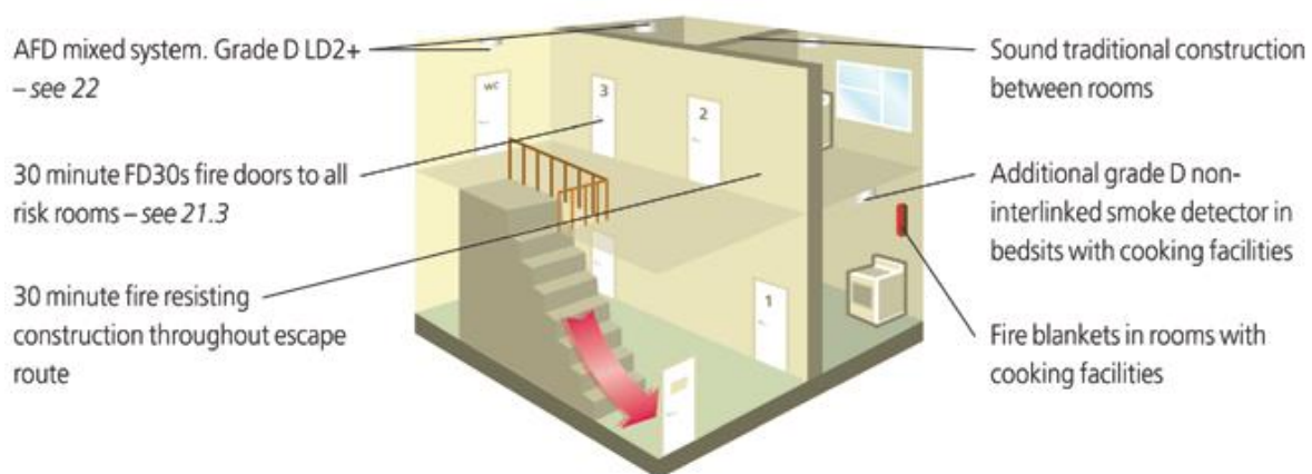
figure D7: bedsit-type HMO, two storeys